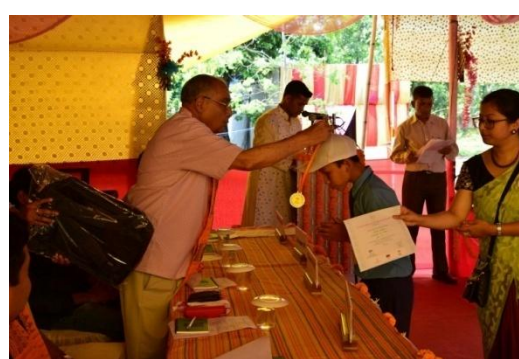
Student receiving prizes from dignitaries