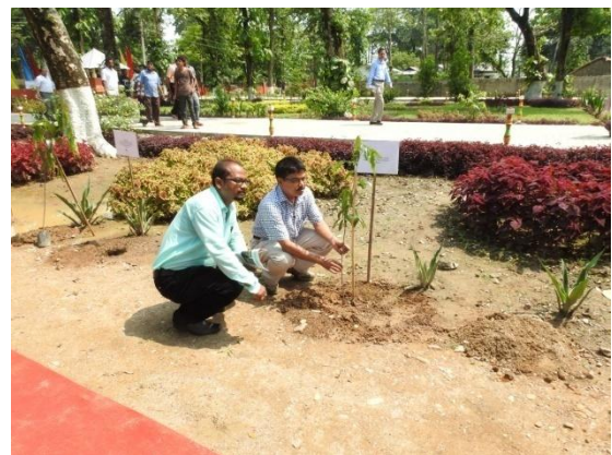
Plantation by villagers & other officials

5. Seeds & Seedling Distribution: The programme ended with the free distribution of rare species of seedlings in a biodegradable non-oven cloth bag and seeds of valuable trees species were distributed in packets to the general public.