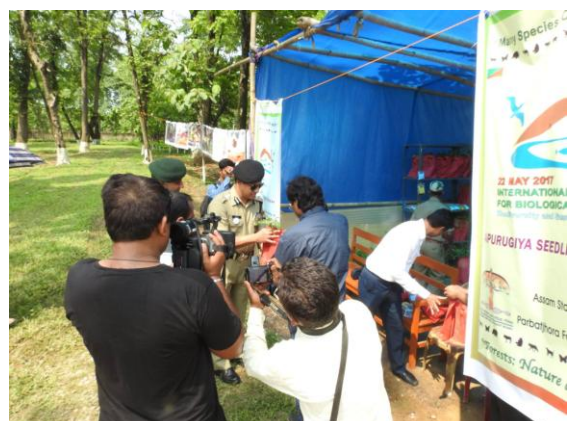
Seeds & plant saplings distribution