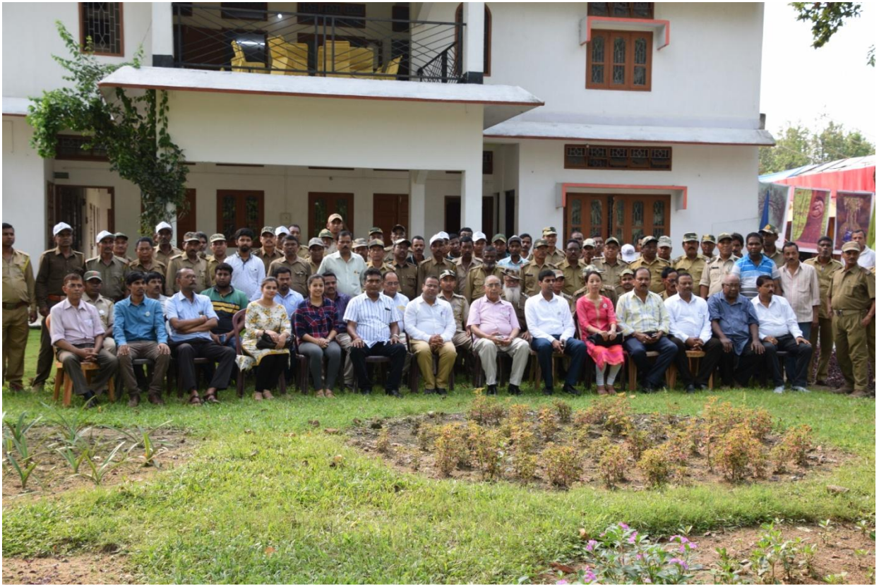
IDB, 2017 Celebration Team