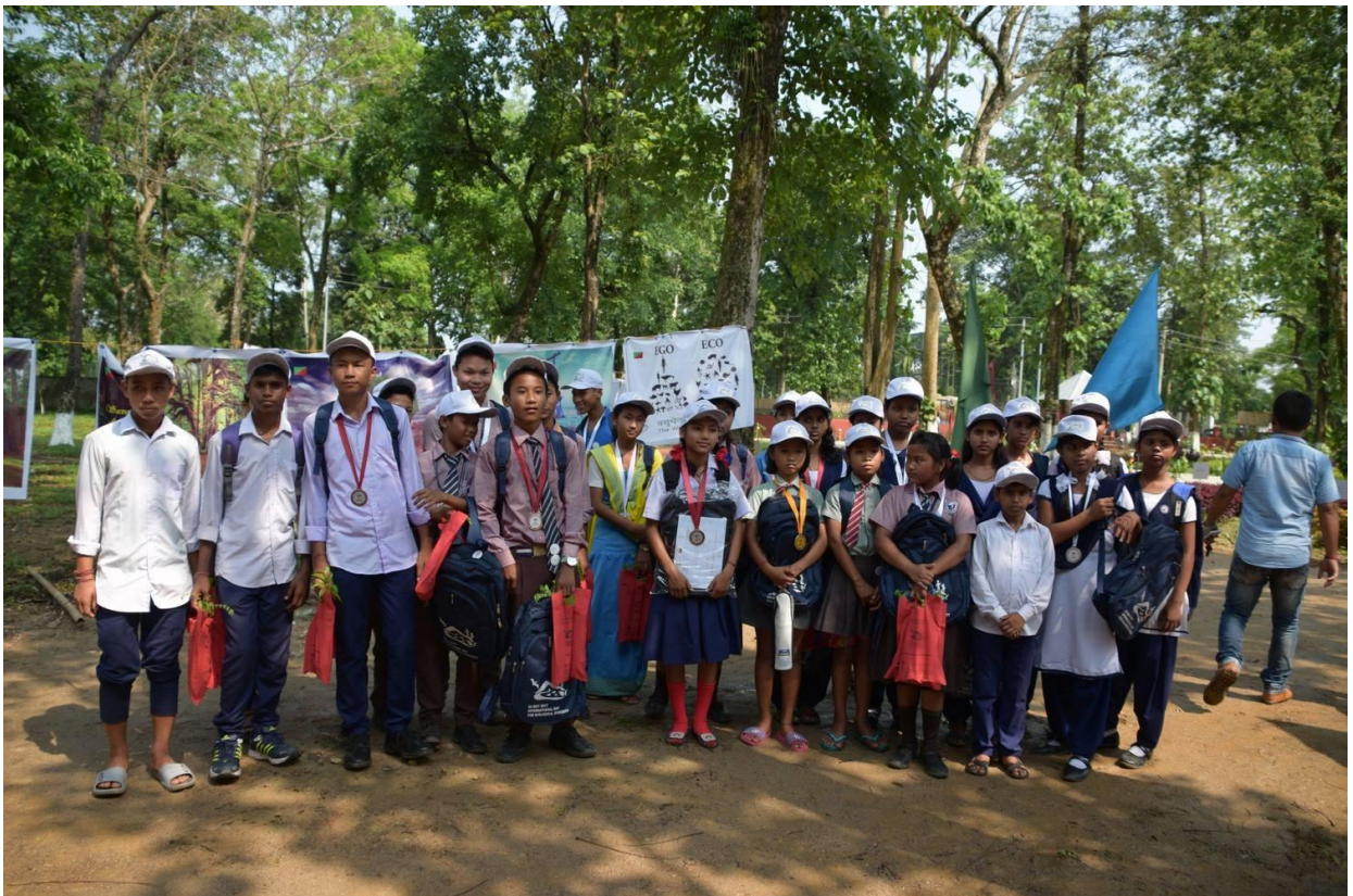
Winners of different competitions

Invitation, advertisement and celebration news on local media